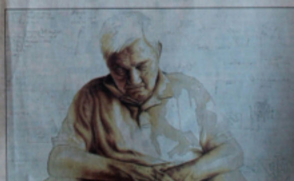
One of the artworks to be featured at the show