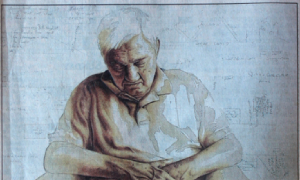
One of the artworks to be featured at the show