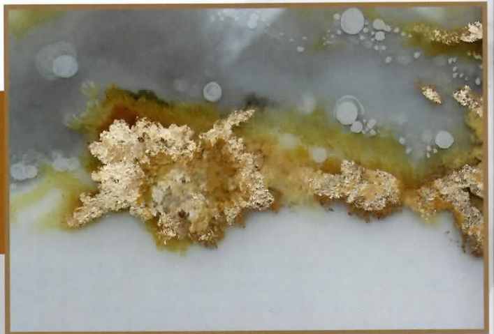
Figure 5b. Golden Agate (detail).