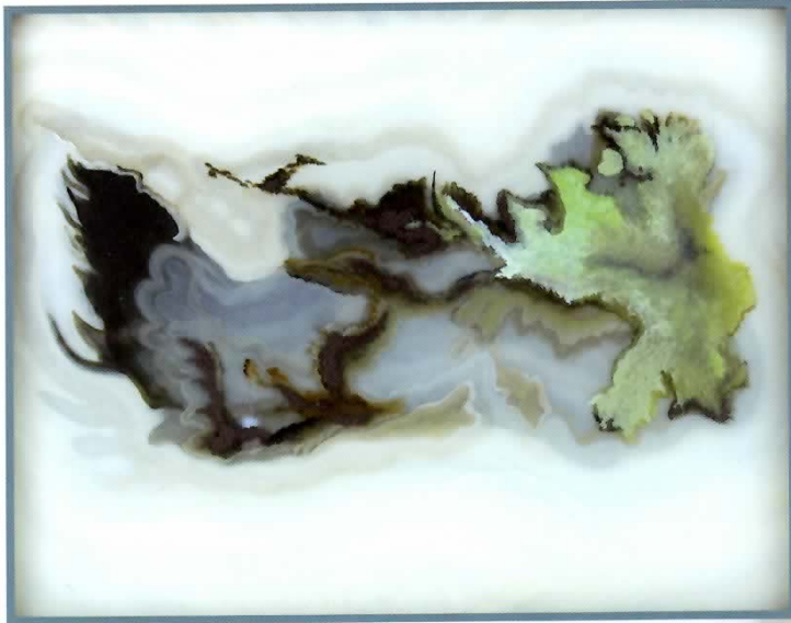
Figure 3. Turquoise Topography I, 2016; 20" × 24"; encaustic and silver metallic, and impasto modeling wax.