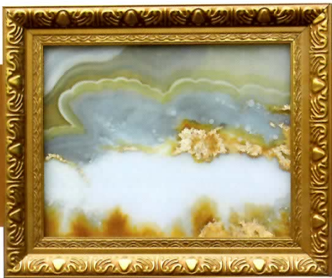
Figure 5a. Golden Agate, 2017; 15" × 18"; six layers of oil paints and epoxy resin.